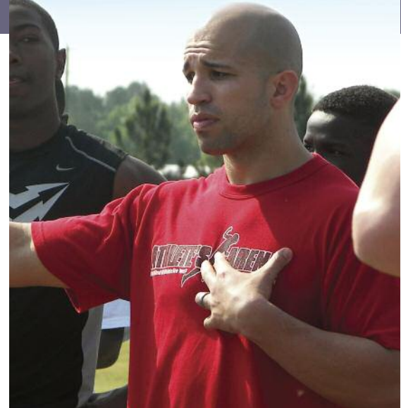
By Joshua Ortegon, CSCS Athlete's Arena Sports Performance

➤ Training to failure is training to fail: Maxing out in the weight room every time you lift or pushing as hard as you can when you go out with your buddies to run sprints will only lead to injury, pain and a short career as a Weekend Warrior. Learn to "keep some gas in the tank" when you train; cycle your workouts and incorporate light and medium training days to practice lifting technique and form.